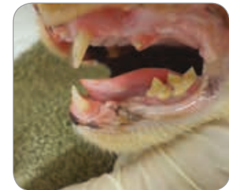
Red marks on the gums are a sign of gum disease

FORLs (resorptive lesions) -These are very painful small holes that appear in the teeth of some cats. It is not clear why they occur but teeth will always need attention if they are present.